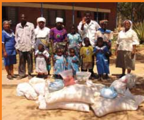
Starter packs and maize being received by grandparents of six of our returnees at Kaelemba Mission, 120 kilometres south of Blantyre.

Generous funding from Strathclyde University provided 350 starter packs and 15 tons of emergency maize. The starter packs contain fertilizers, bean and maize seeds which will be planted soon after the first rains in November. This will lead, hopefully, to a decent harvest next April. In the meantime the maize and the packs are distributed to needy grandparents and carers of our growing numbers of returned orphans. This is particularly important in this year of acute food shortages in Malawi.