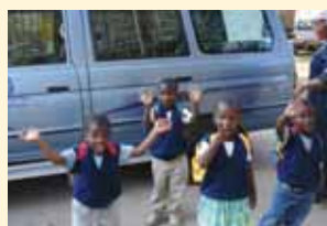
The "Famous Four" go to school, their day starts at half past six!