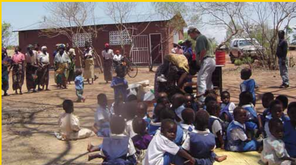
The official opening of Kumanda Nursery School and Feeding Station October 2005

Global Aids Interfaith Alliance (GAIA), combined with Ashville College to finance and build a new nursery school and feeding station at Kumanda, 20 kilometers from Blantyre, and home to a small group of returned Open Arms Orphans. Work commenced in the first week of July and the completed building was opened in October. Fifty small children including fourteen orphans receive a basic education and one nutritious meal a day at the centre.